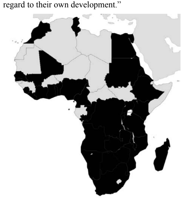
China's Confucius Institutes in Africa

alleviation. In May 2007, at the annual conference of the African Development Bank Council held in Shanghai, questions like African infrastructure construction, enterprise capability construction, debt management and poverty alleviation were discussed. That is another significant action taken by China to promote exchange and cooperation with African countries in aspects of development experience and state affairs management. After the Beijing Summit FOCAC Thabo Mbeki, former president of South Africa wrote an article titled "At the Heavenly Gate in Beijing hope is born" highly China's "Great achievements praising development" and its practical significance to Africa's development<sup>4</sup>. The World Bank also acknowledged, "China's efforts created immediate opportunities for the economy of other developing countries as well as chances for them to acquire abundant knowledge and experience from China in