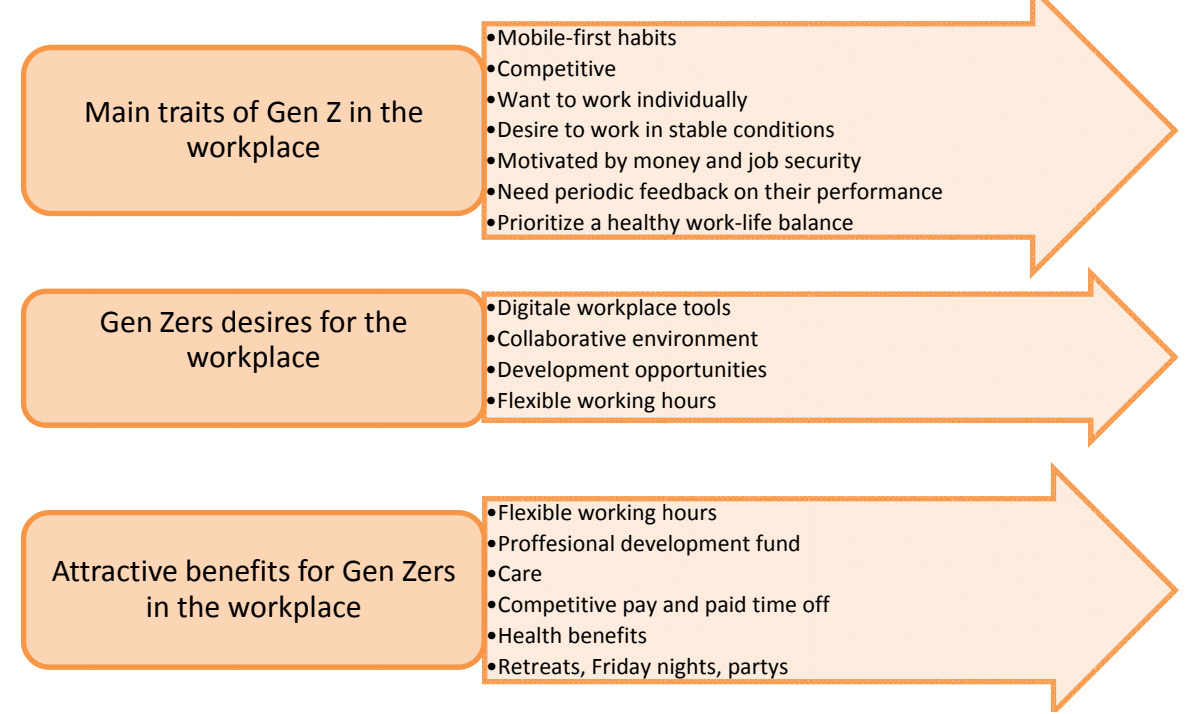
Figure 2. Gen Z in the workplace [11]

When working with Gen Zers, managers must be ready to adapt to the pace of evolution, and very often old ways of working can be replaced by new ones. The figure 2 shows some of the characteristics they possess and what they are looking for in today's workplace.